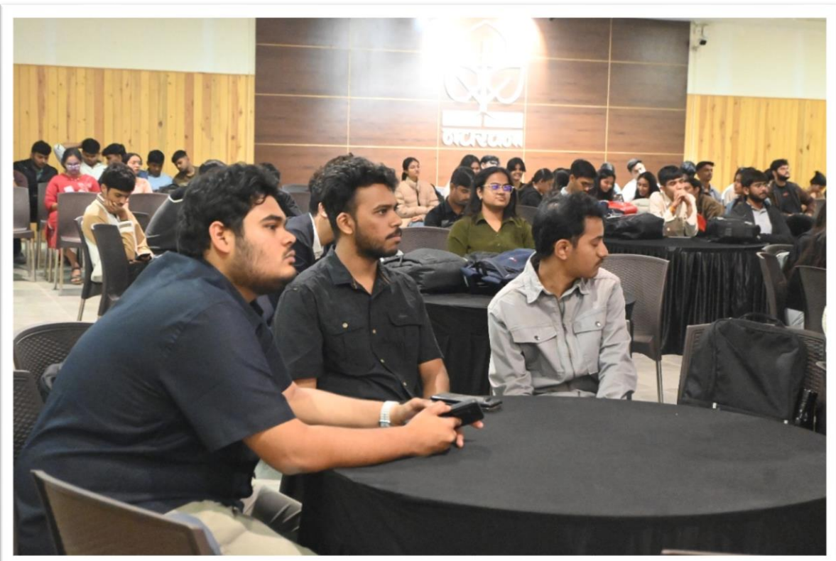
Student Start-ups Attendees