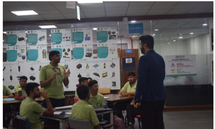
Glimpes of the event including students of UG, PG & Faculties.