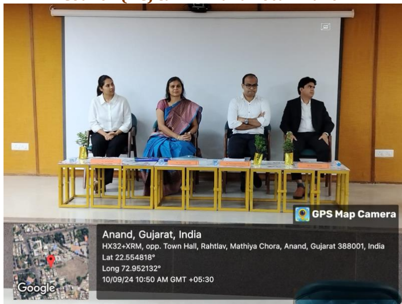
Prayer and SRKSM song

Organized by Anand Pharmacy College supported by Student Startup Innovation Policy (SSIP), Institution's Innovation Council (IIC) & IPA Anand Local Branch