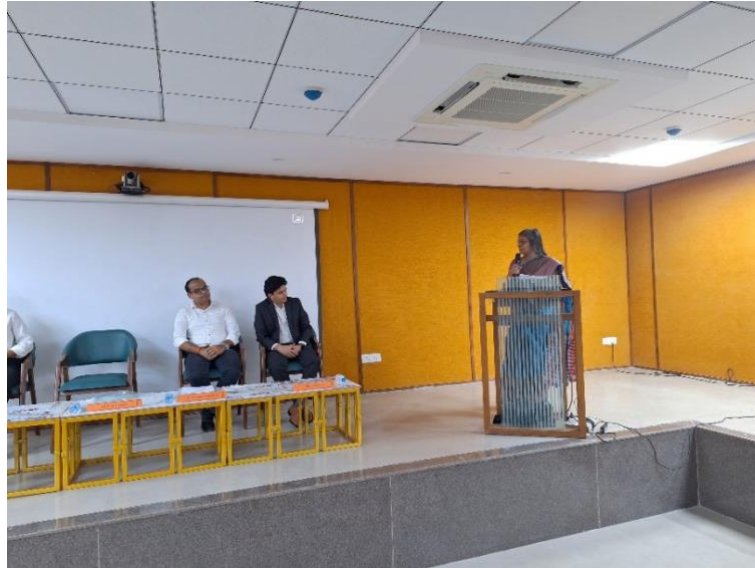
Floral Felicitation of Guests