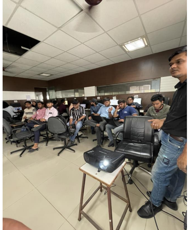
Sign of Event Coordinator: