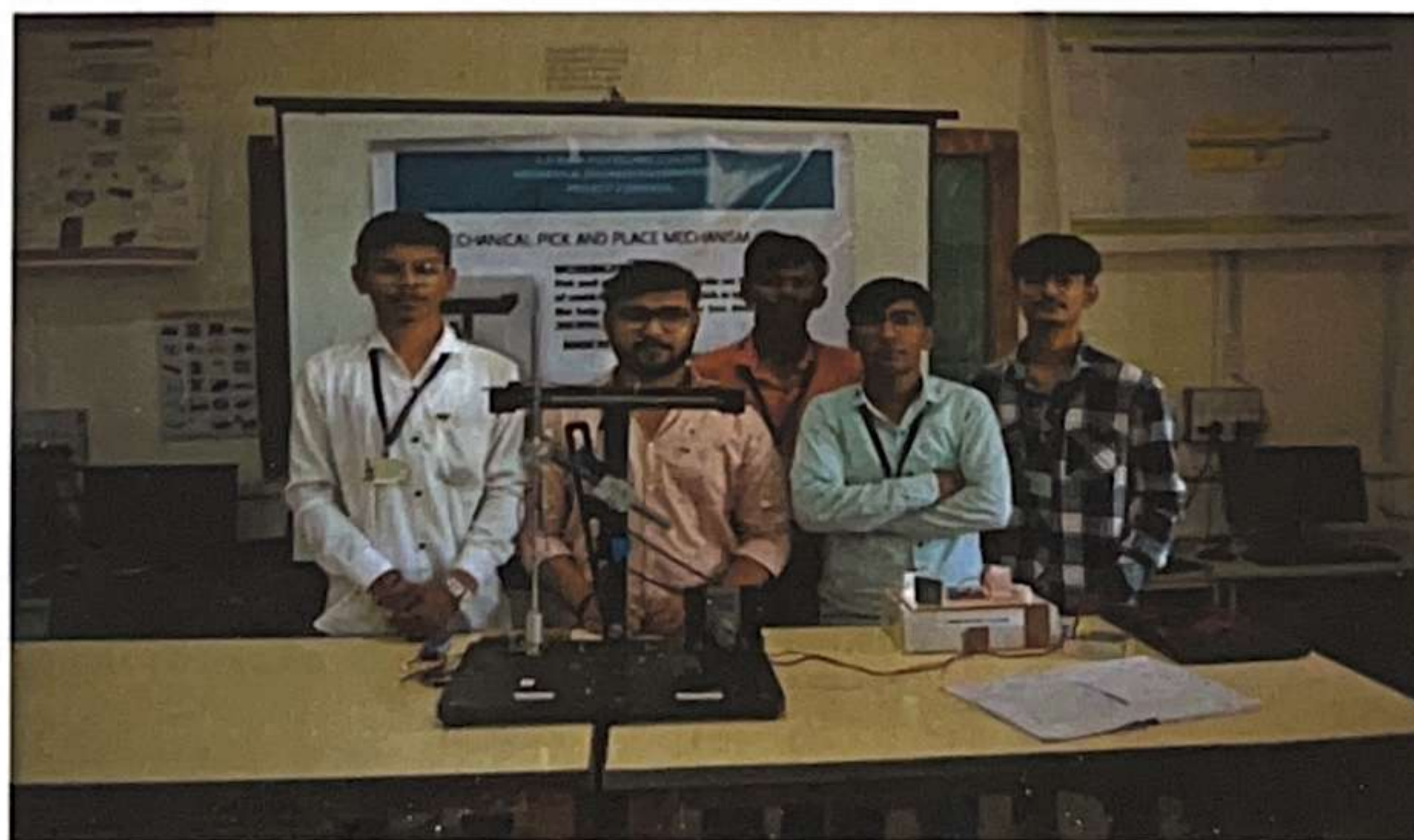
MECHANICAL PICK & PLACE MECHANISM