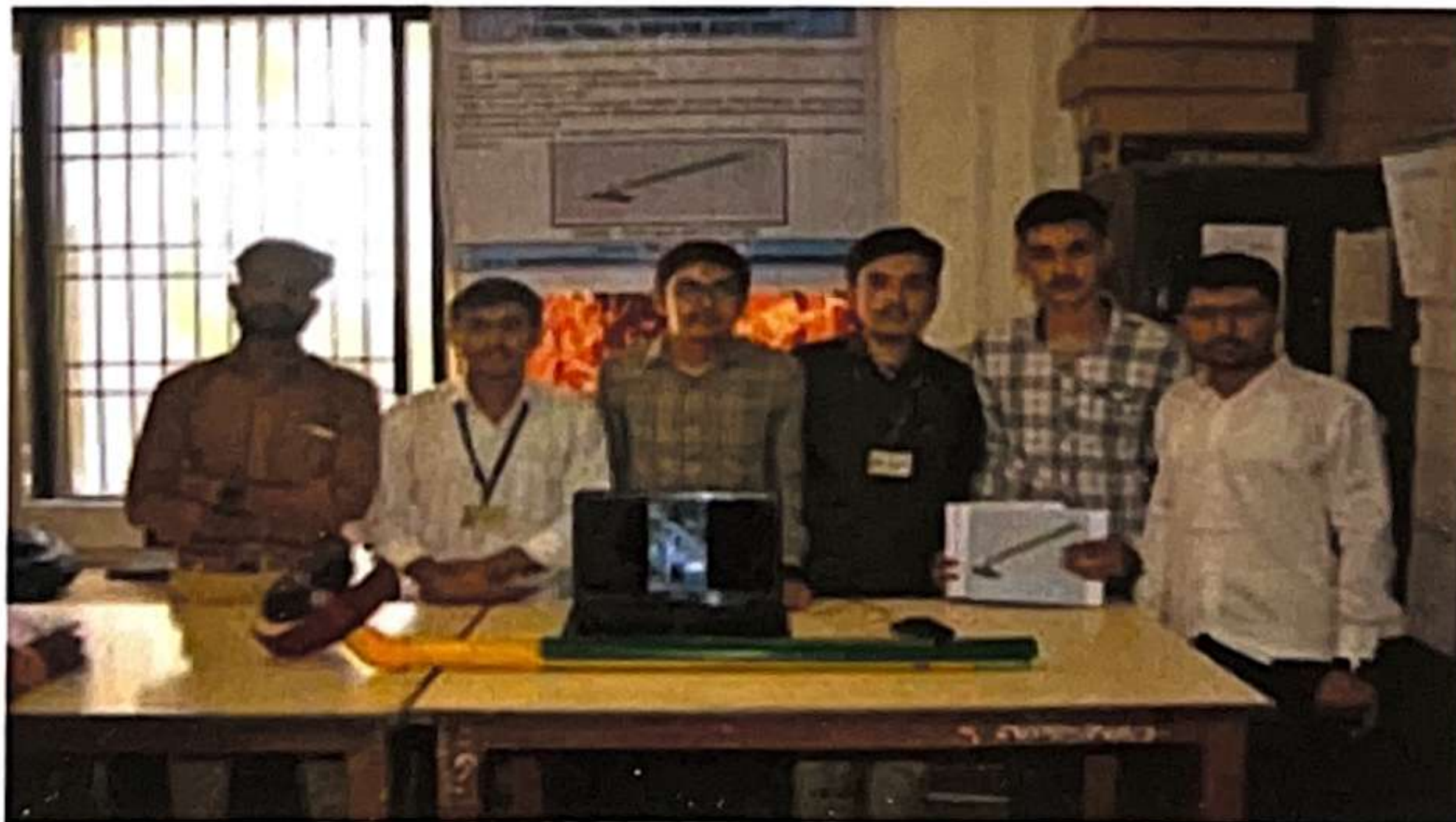
PORTABLE GRASS CUTTER