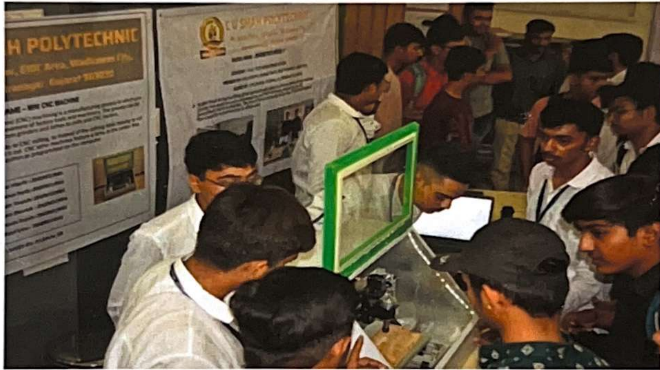
MINI CNC MACHINE