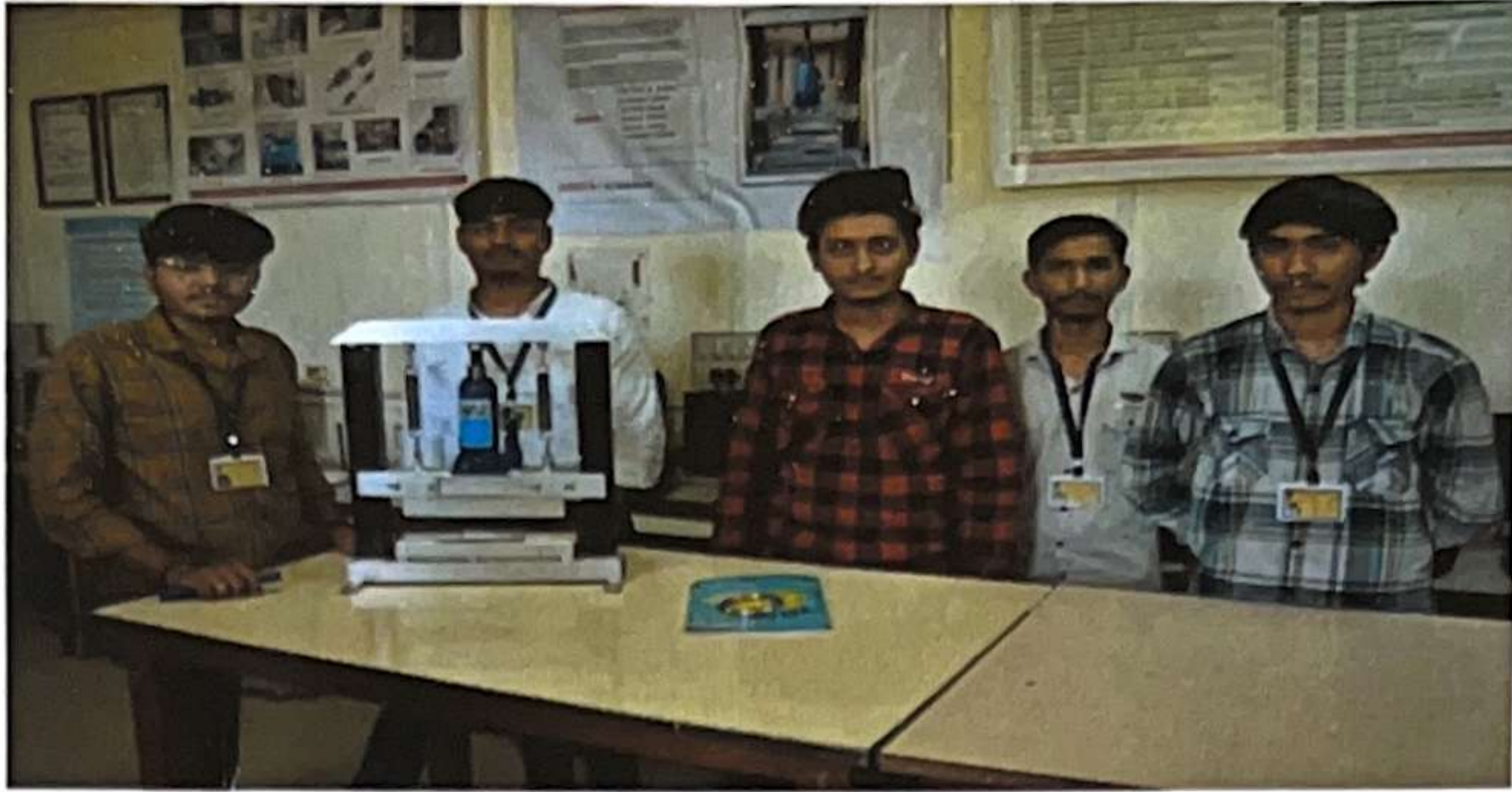
HUDRAULIC BENDING MACHINE