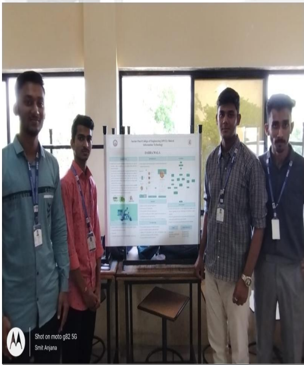
Shot on moto g82 5G Smit Anjana