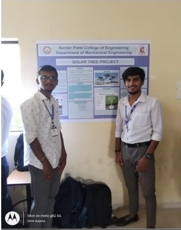
Shot on moto g82 5G Smit Anjana