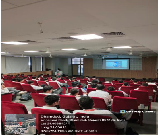
Dhamdod, Gujarat, India Unnamed Road, Dhamdod, Gujarat 394125, India Lat 21.498842° Long 73.0083° 07/02/24 11:58 AM GMT +05:30