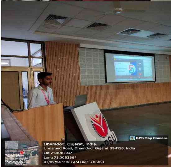
Dhamdod, Gujarat, India Unnamed Road, Dhamdod, Gujarat 394125, India Lat 21.498794° Long 73.008288° 07/02/24 11:53 AM GMT +05:30