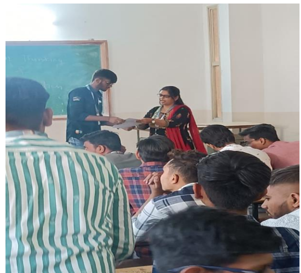
Preparing Ideation Cancas